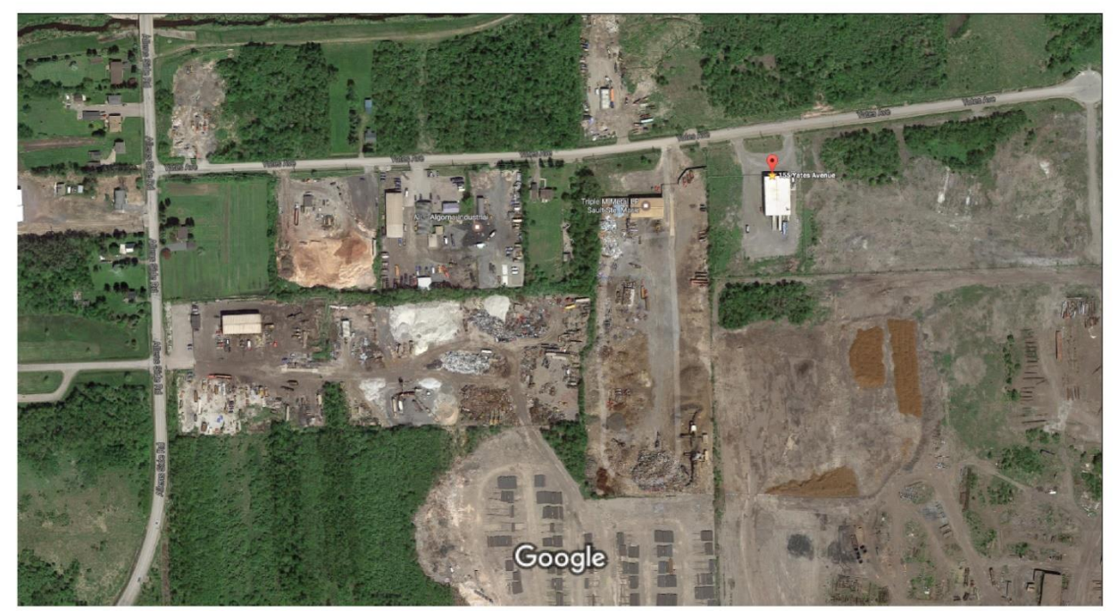
Imagery ©2017 Google, Map data ©2017 Google 50 m